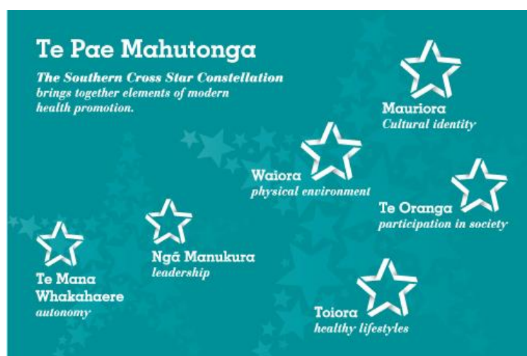
Figure 1. Te Pae Mahutonga health promotion framework 18

Health Promotion is defined as ‘the process of enabling people to increase control over their health and its determinants, and thereby improve their health’, 14 and Te Pae Mahutonga health promotion framework 18 provides a uniquely New Zealand approach to health promotion (see Figure 1 below). This policy statement on mental health aligns with Te Pae Mahutonga’s 18 mauriora (cultural identity), waiora (physical environment), toiora (healthy lifestyles), te oranga (participation in society), ngā manukura (community leadership), and te mana whakahaere (autonomy) components.